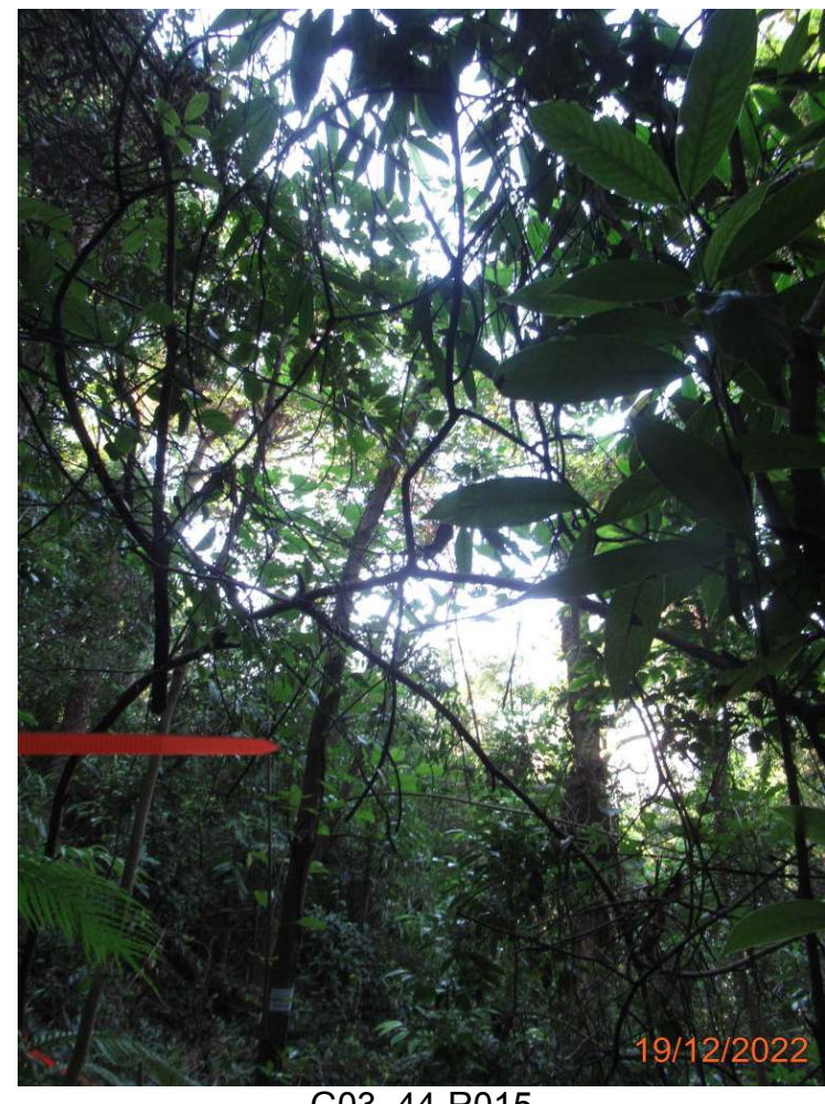
Contract No.: NL/2020/02 Tung Chung New Town Extension - Salt Water Supply System Monthly Report (19 December 2022) In-situ Plant Species of Conservation Importance - Photographic Records