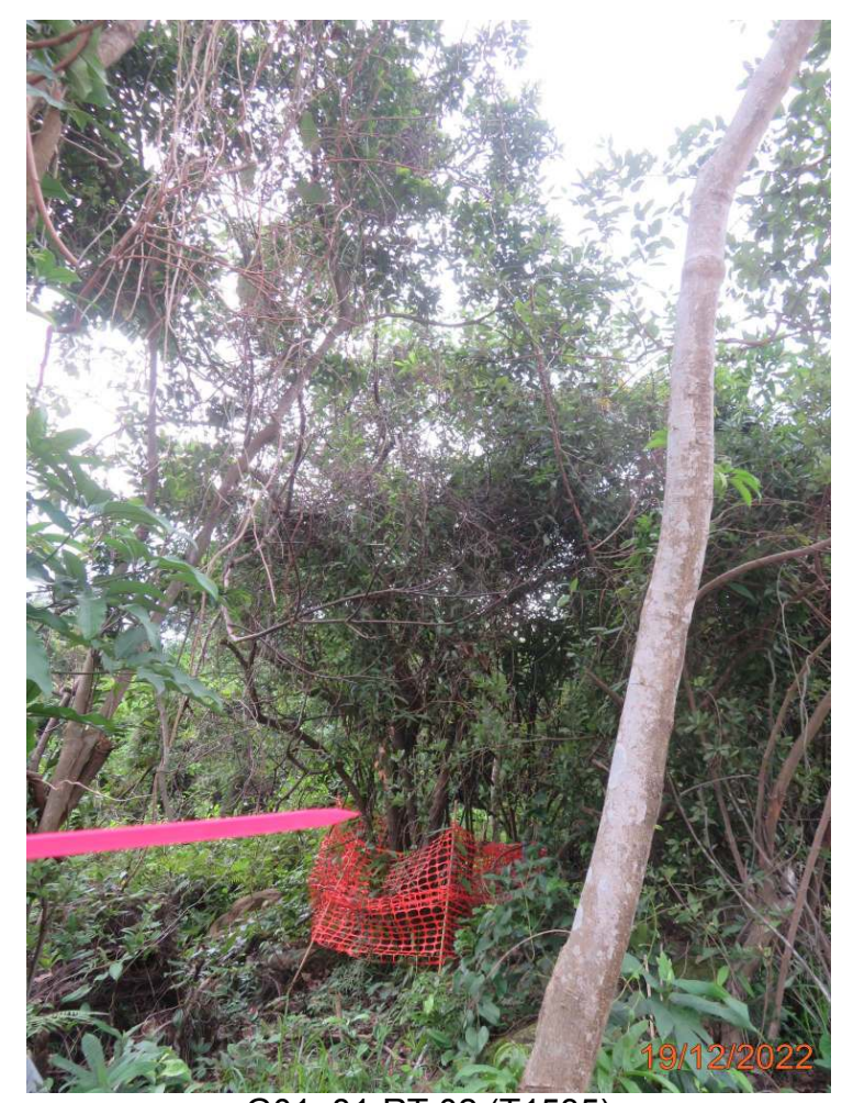
Contract No.: NL/2020/02 Tung Chung New Town Extension - Salt Water Supply System Monthly Report (19 December 2022) In-situ Plant Species of Conservation Importance - Photographic Records