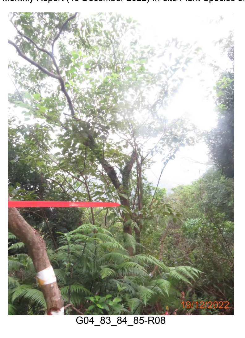
Contract No.: NL/2020/02 Tung Chung New Town Extension - Salt Water Supply System Monthly Report (19 December 2022) In-situ Plant Species of Conservation Importance - Photographic Records