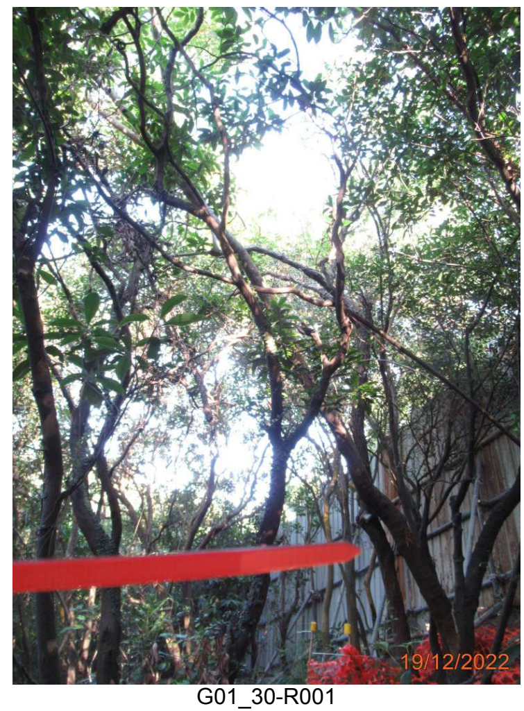
Contract No.: NL/2020/02 Tung Chung New Town Extension - Salt Water Supply System Monthly Report (19 December 2022) In-situ Plant Species of Conservation Importance - Photographic Records